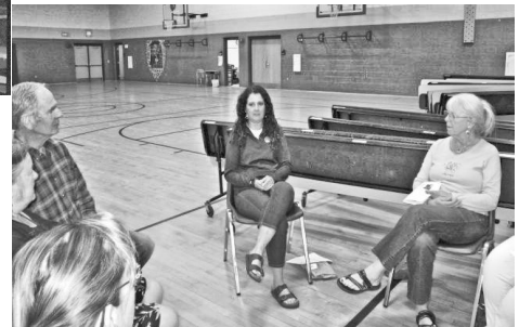
Right: Breakout Session at last year's Annual Meeting. This year there will be groups on Winged Wildlife at Pawtuckaway; the Lake Host Program; Tree Cutting, Docks, and FAQ's; and the History of Pawtuckaway Lake and Origins of the State Park. Please come and join us!