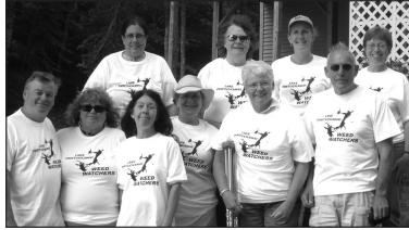
Keep an eye out for the Weed Watchers this summer, patrolling the lake in their fluorescent green T-shirts. Also, lend a hand whenever you can!