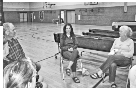
Right: Breakout Session at last year's Annual Meeting. This year there will be groups on Winged Wildlife at Pawtuckaway; the Lake Host Program; Tree Cutting, Docks, and FAQ's; and the History of Pawtuckaway Lake and Origins of the State Park. Please come and join us!